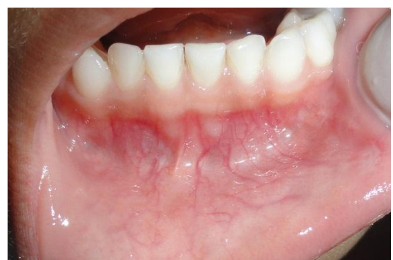
Fig 4: Uneventful healing of the surgical area after excision.

The specimen was placed in 10% formalin and sent for histo-pathological examination. One week later the sutures were removed, with normal healing being observed (Figure 4).