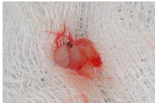
Fig 3: Excised tissue (Mucocele).

The specimen was placed in 10% formalin and sent for histo-pathological examination. One week later the sutures were removed, with normal healing being observed (Figure 4).