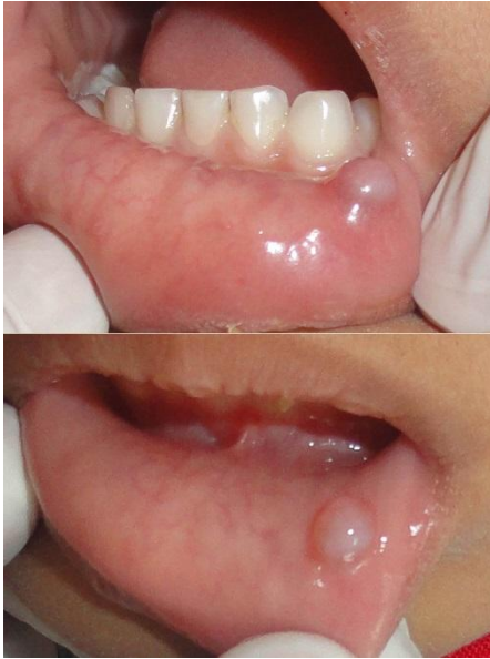
Fig 1: Intraoral view showing mucocele on the lower lip.

The history of present illness consisted of swelling on the lower lip since 1 month seen in the inner aspect of lower lip against teeth #73 and #74 region. The growth was of negligible size when the patient first noticed it, but had grown rapidly over the past one week to attain the present size. Patient gave history of trauma one month ago while mastication. The patient's medical and family history was not significant.