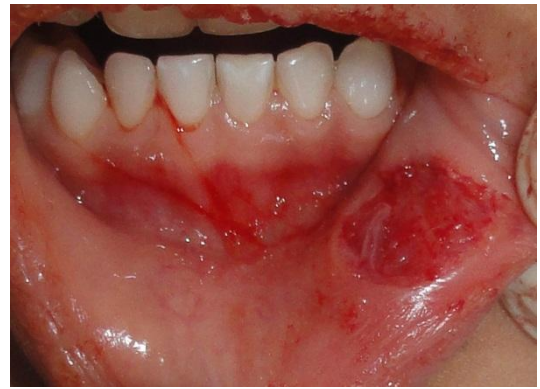
Fig 2: Intraoperative photograph showing Surgical Excision of Mucocele.

The hemogram of the patient was within normal limits. Excision of the growth was performed under local anaesthesia (Figure 2 and 3). The surgical site was irrigated with povidone iodine - saline solution and closed primarily with 3-0 silk sutures. All post-operative instructions were given and analgesics were prescribed.